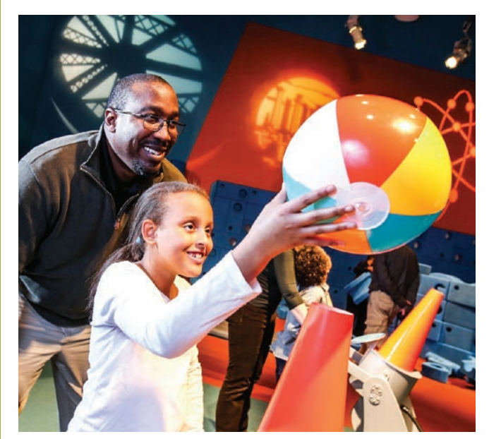
CONNECTICUT SCIENCE CENTER

Registration Deadline: June 24, 2016 or until filled