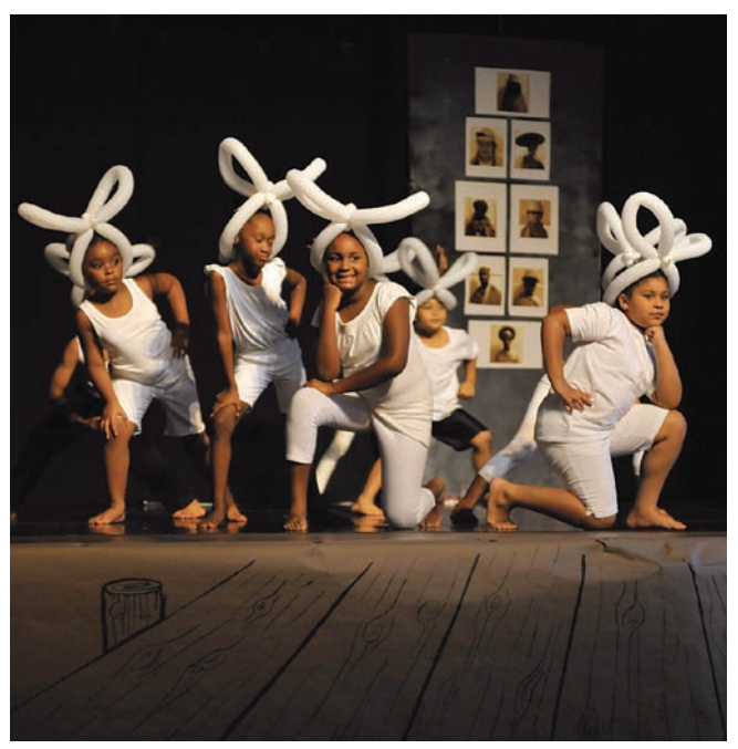
SPECTRUM IN MOTION