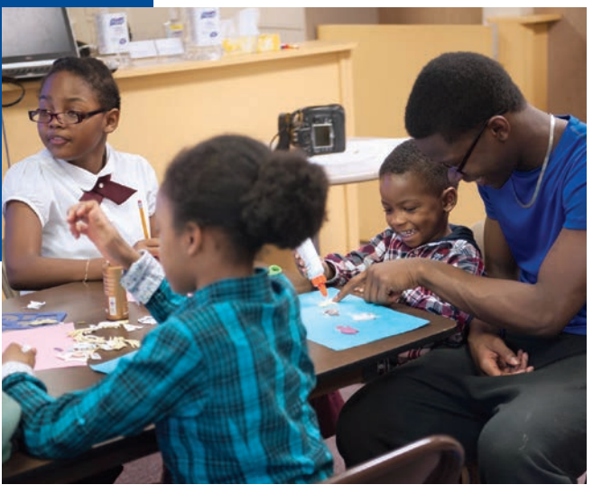
ASYLUM HILL FAMILY CENTER

Parents, caregivers and young children can engage in a variety of fun and educational activities at any one of Hartford's six Brighter Futures Family Centers.