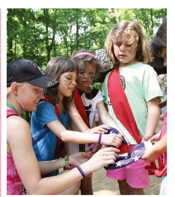
GIRL SCOUTS OF CONNECTICUT

Registration Deadline: Open until filled