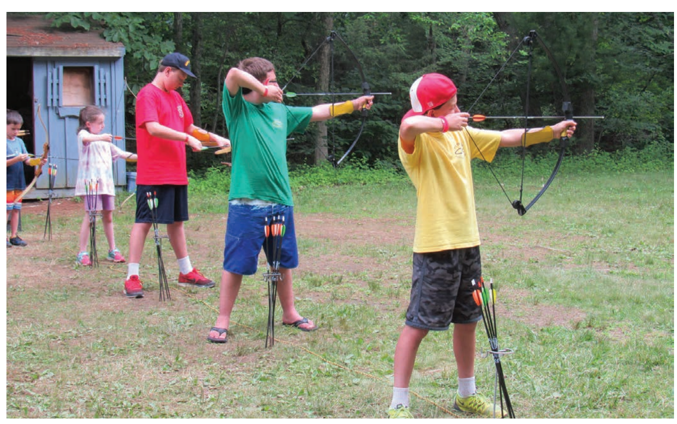
CHANNEL 3 KIDS CAMP

Website: www.ywcahartford.org Registration Deadline: June 13, 2016 or until filled