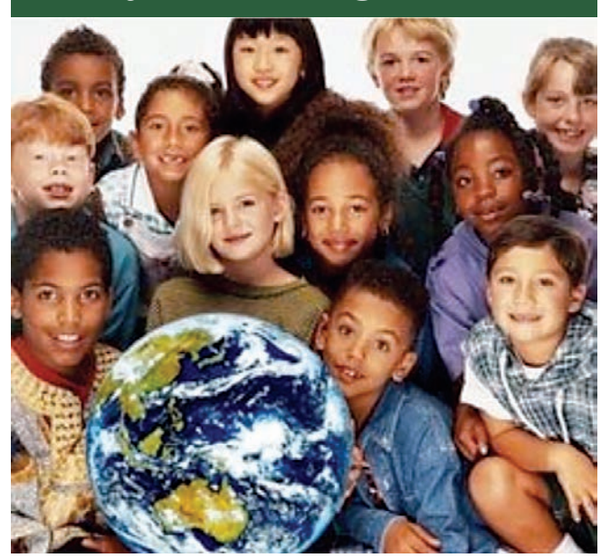
READ all summer! You never know where a book will take you...