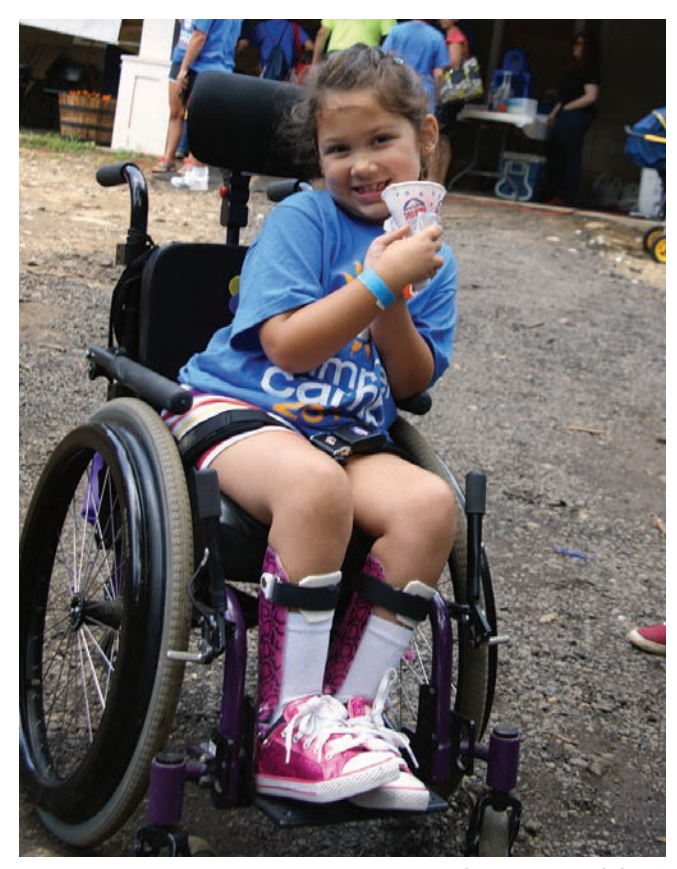
CHANNEL 3 KIDS CAMP

Registration Deadline: May 1, 2016 or until filled